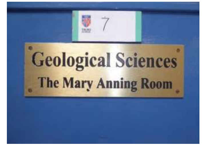
Figure 3: The door of the Mary Anning room at Truro School.

'The mineral extraction industry is vital to the economy and our way of life. Minerals are essential, representing the largest material flow in the economy and should not be taken for granted. Indeed it is hoped that ... their role and contribution will finally be recognised and valued by Government and all stakeholders, and that the industry can influence a shift to a more positive perception of what it does.' (piii)